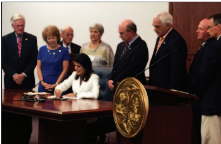
On June 23, 2016, Governor Nikki Haley signed two ethics reform bills into law: Income Disclosure and Independent Investigation .